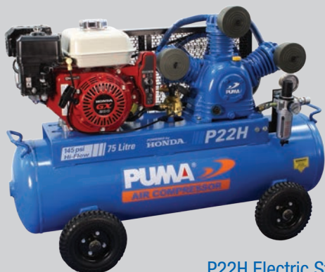
P22H Electric Start