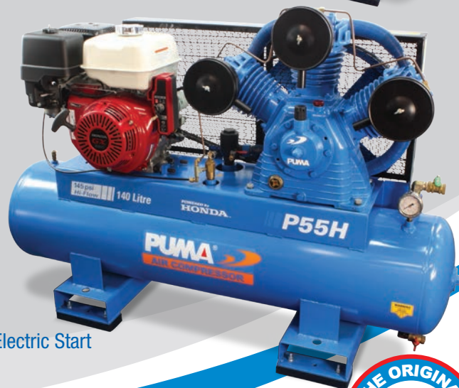
P55H Electric Start