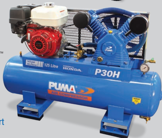
P30H Manual Start