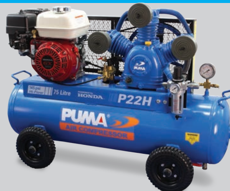
P22H Manual Start