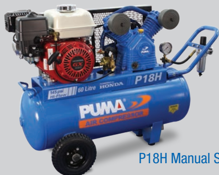
P18H Manual Start